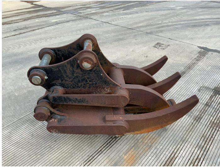
5 FINGER GRAB TO SUIT 20 TONNE EXCAVATOR